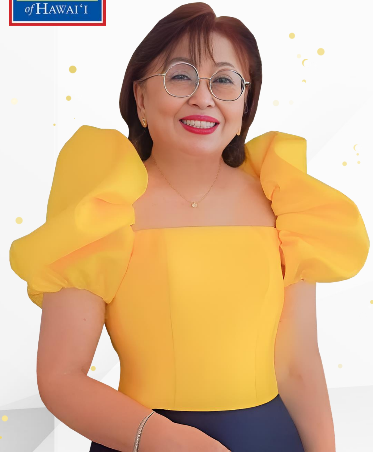
HON. MA. ESTER E. HAMOR MAYOR, CITY OF SORSOGON